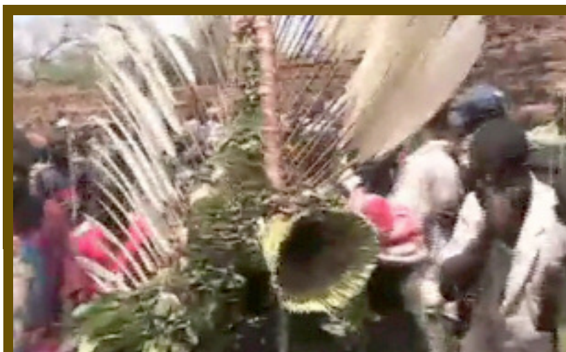
Shaping a Mask of Leaves for Do

“We must distinguish between agents and causes. Asbestos fibers and pesticides are the agents of disease and disability, but it is illusory to suppose that if we eliminate these particular irritants that the diseases will go away, for other similar irritants will take their place. So long as efficiency, the maximisation of profit from production, or the filling of centrally planned norms of production without reference to the means remain the motivating forces of productive enterprises the world over, so long as people are trapped by economic need or state regulation into production and consumption of certain things, then one pollutant will replace another. Regulatory agencies or central planning departments will calculate cost and benefit ratios where human misery is costed out at a dollar value. Asbestos and cotton lint fibres are not the causes of cancer. They are agents of social causes, of social formations that determine the nature of our productive and consumptive lives, and in