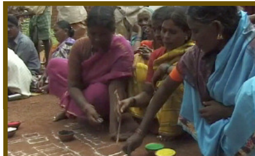
The Alternative Public Distribution System of DDS